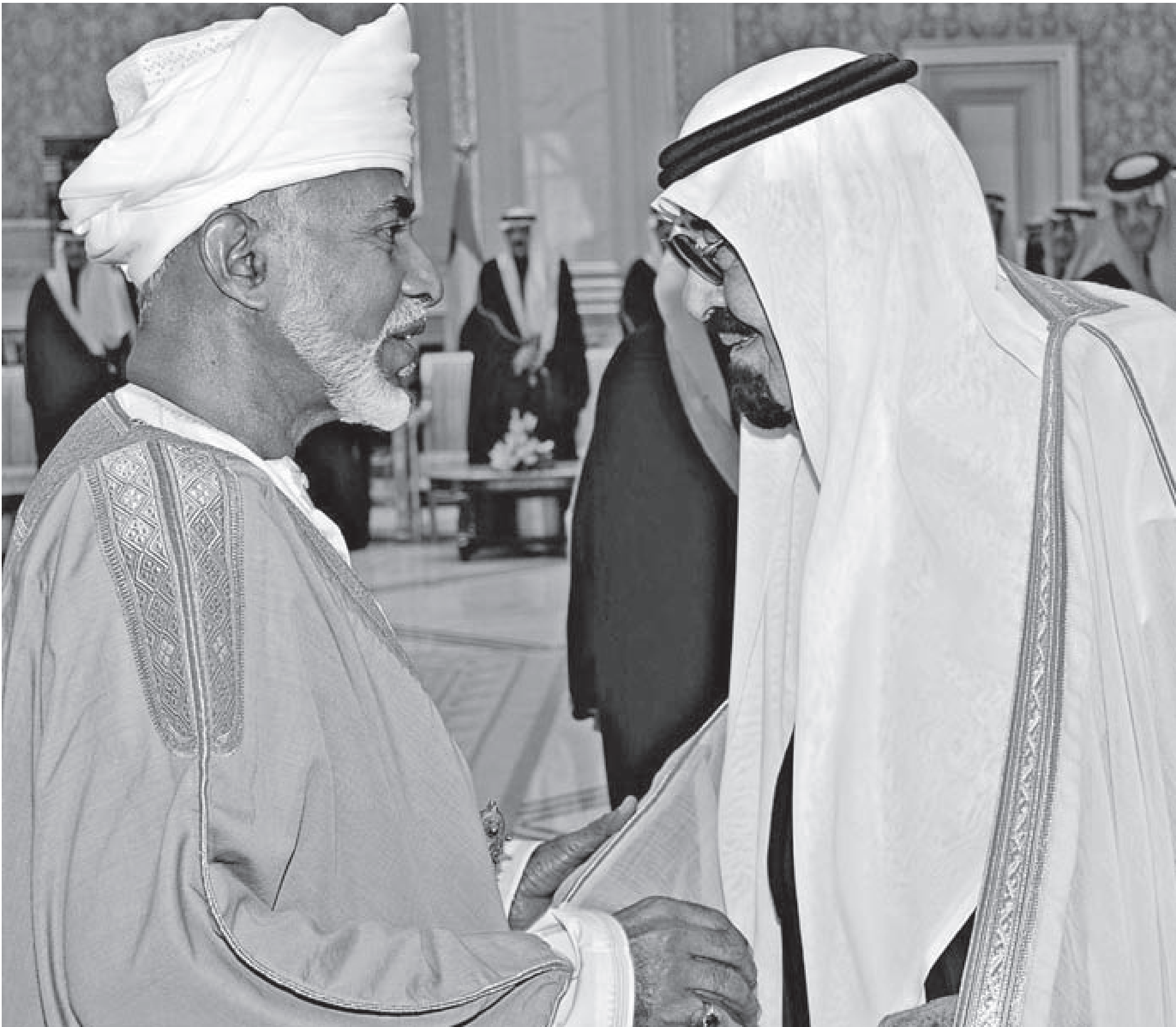
This file photo shows Saudi Arabia's King Abdullah bin Abdul Aziz (right) welcoming His Majesty Sultan Qaboos bin Said at the start of the Gulf Cooperation Council (GCC) summit meeting in Riyadh on December 19, 2011

Muscat served as the back channel for talks between the US and Iran in the lead-up to the 2015 nuclear deal