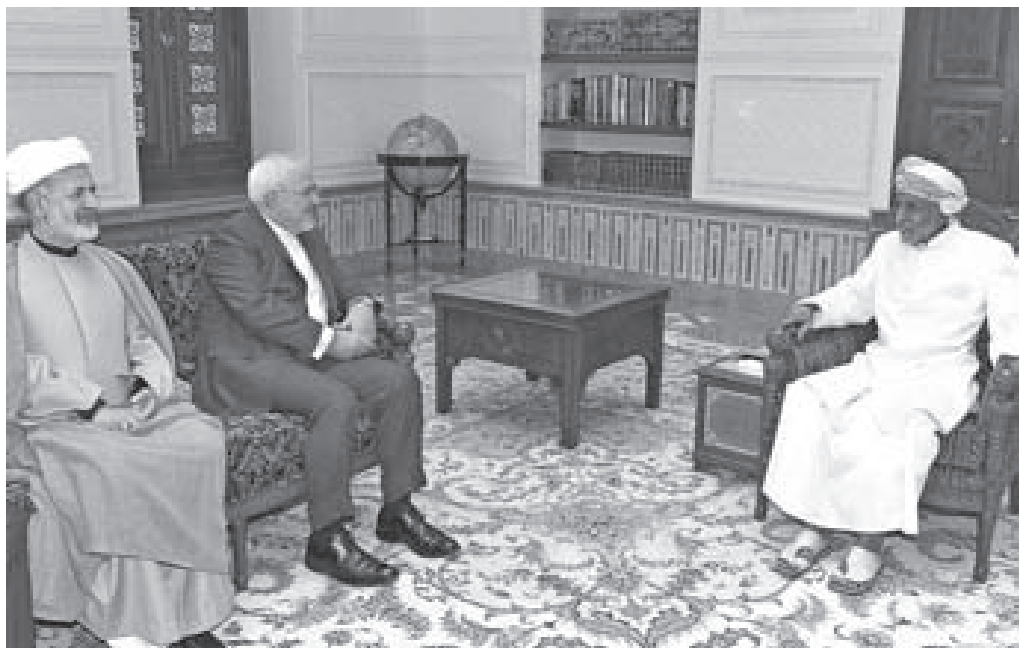
With Iran's Foreign Minister Mohammad Javad Zarif in Muscat