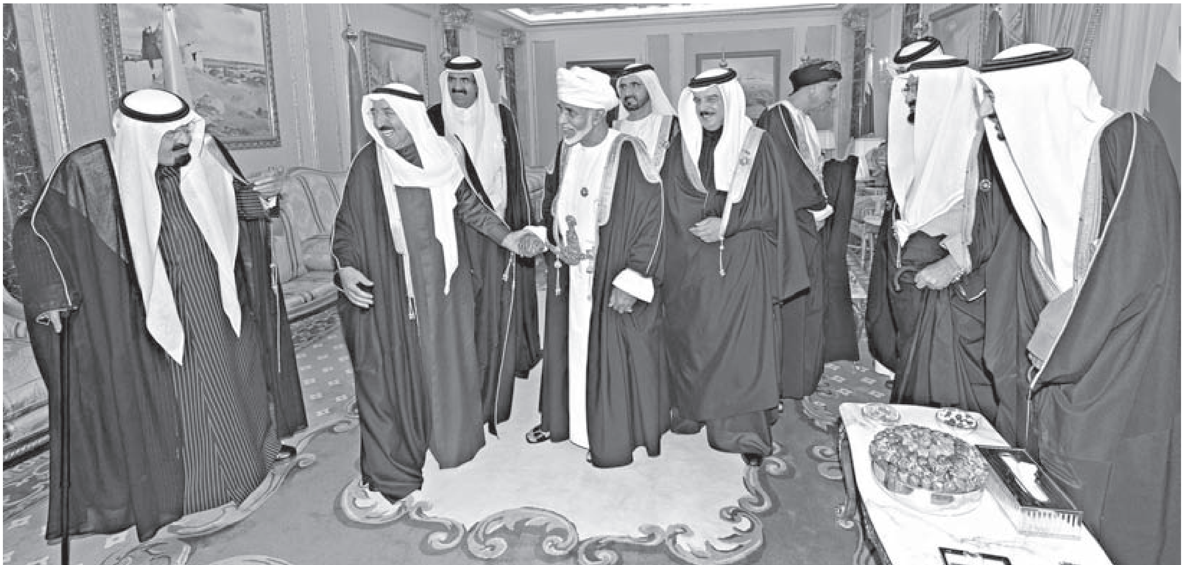
His Majesty Sultan Qaboos bin Said with Gulf Cooperation Council leaders in Riyadh on December 19, 2011