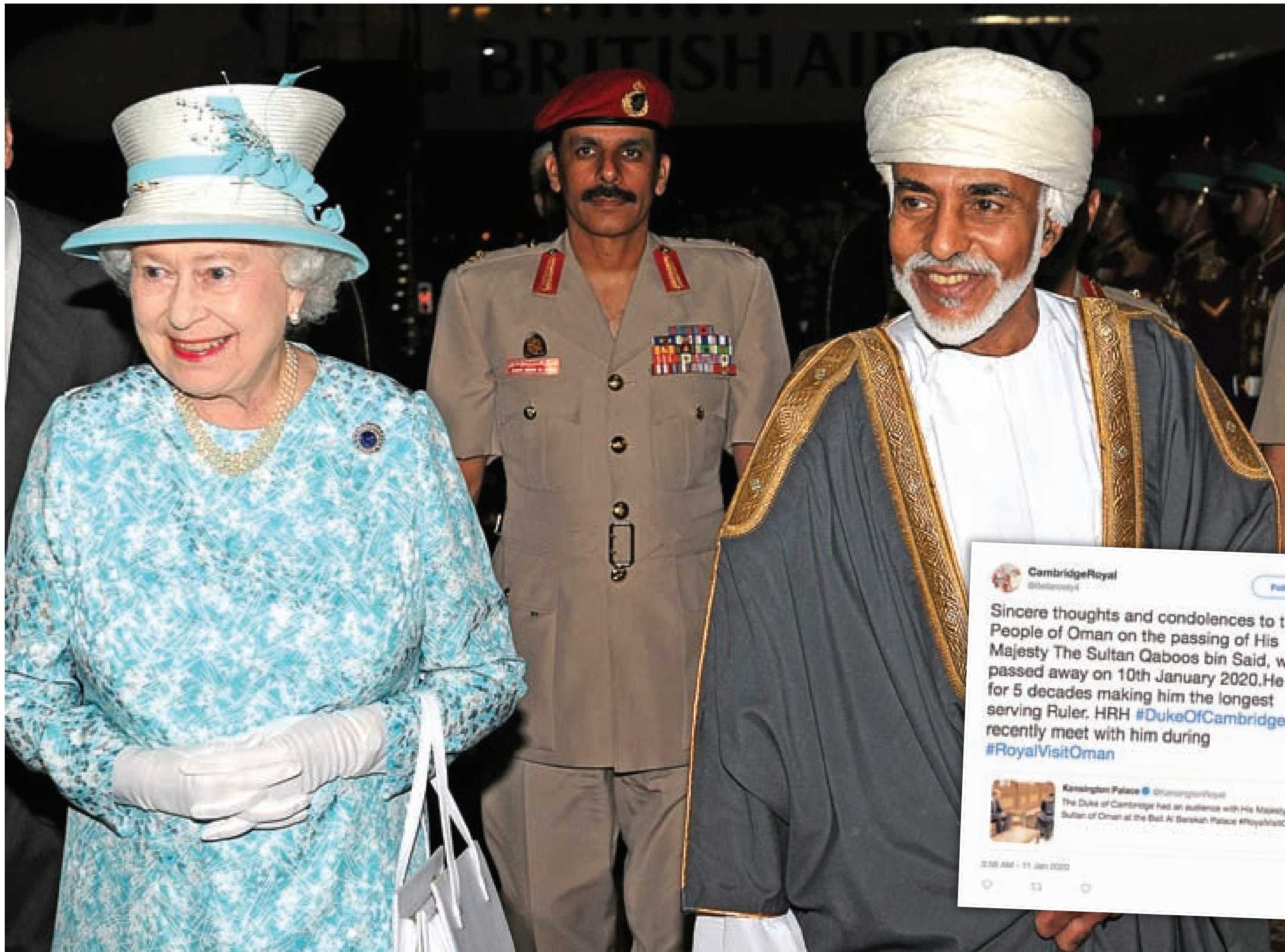
This file photo shows His Majesty Sultan Qaboos bin Said with Britain's Queen Elizabeth II in Muscat on November 25, 2010 (AFP)

SUNDAY, JANUARY 12, 2020 MUSCAT DAILY 49