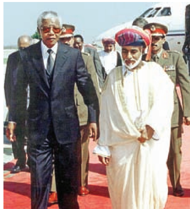
With S Africa's then President Nelson Mandela on April 6, 1999