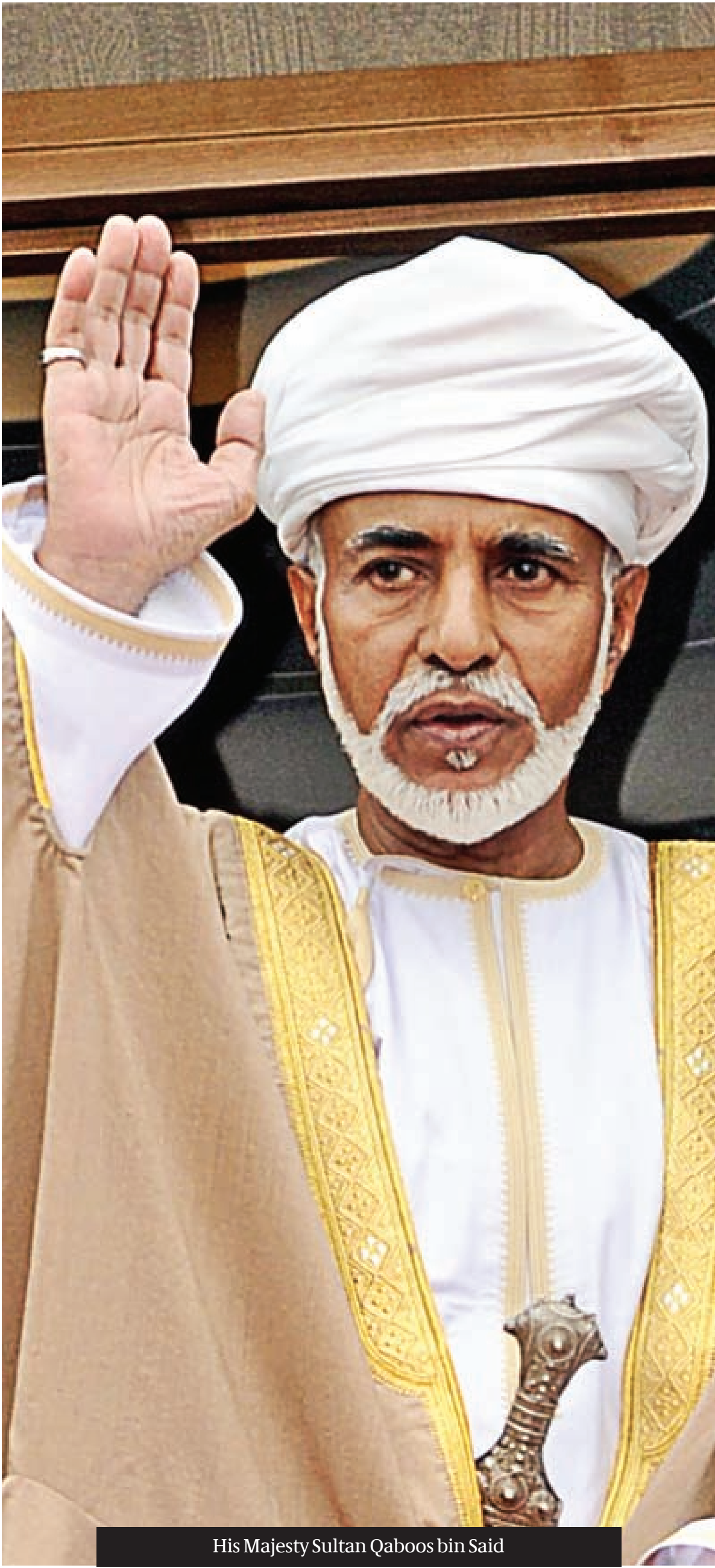
His Majesty Sultan Qaboos bin Said

Oman’s beloved His Majesty Sultan Qaboos has passed away. His Majesty Sultan Haitham has said that the late ruler’s legacy will live on