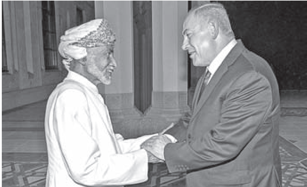
With Israeli Prime Minister Benjamin Netanyahu in Muscat on October 26, 2018