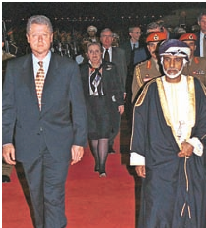
With the then US President Bill Clinton in Muscat on March 25, 2000

Pakistan Prime Minister Imran Khan also extended 'deepest condolences to people of Oman' on the demise of His Majesty Sultan Qaboos. 'He was a visionary & transformed Oman into a vibrant, modern state. Oman has lost a beloved leader & Pakistan a close, trusted friend. May his soul rest in eternal peace', Khan tweeted.