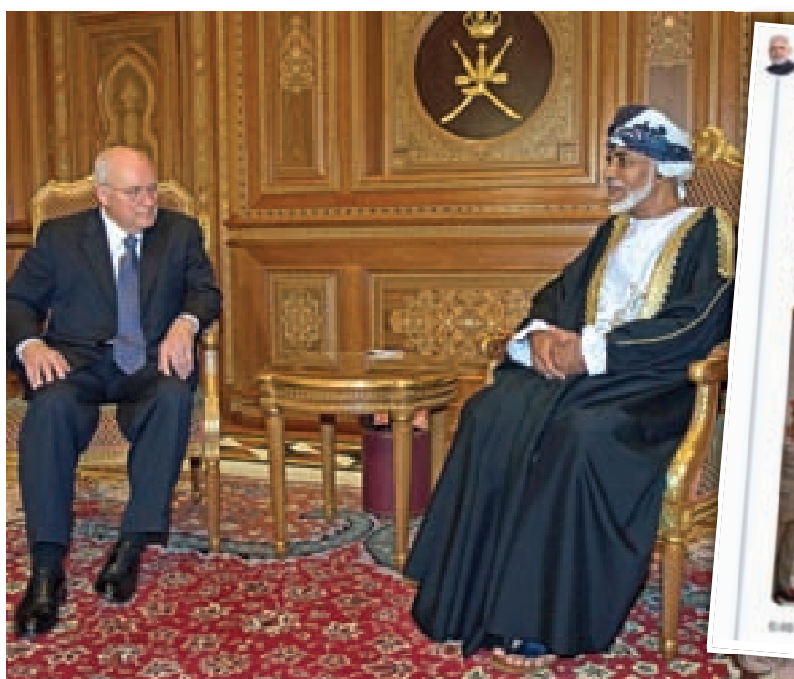
With the then US Vice President Dick Cheney in Muscat on March 19, 2008