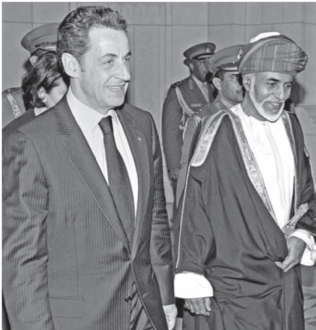
With the then French President Nicolas Sarkozy in Muscat on February 10, 2009