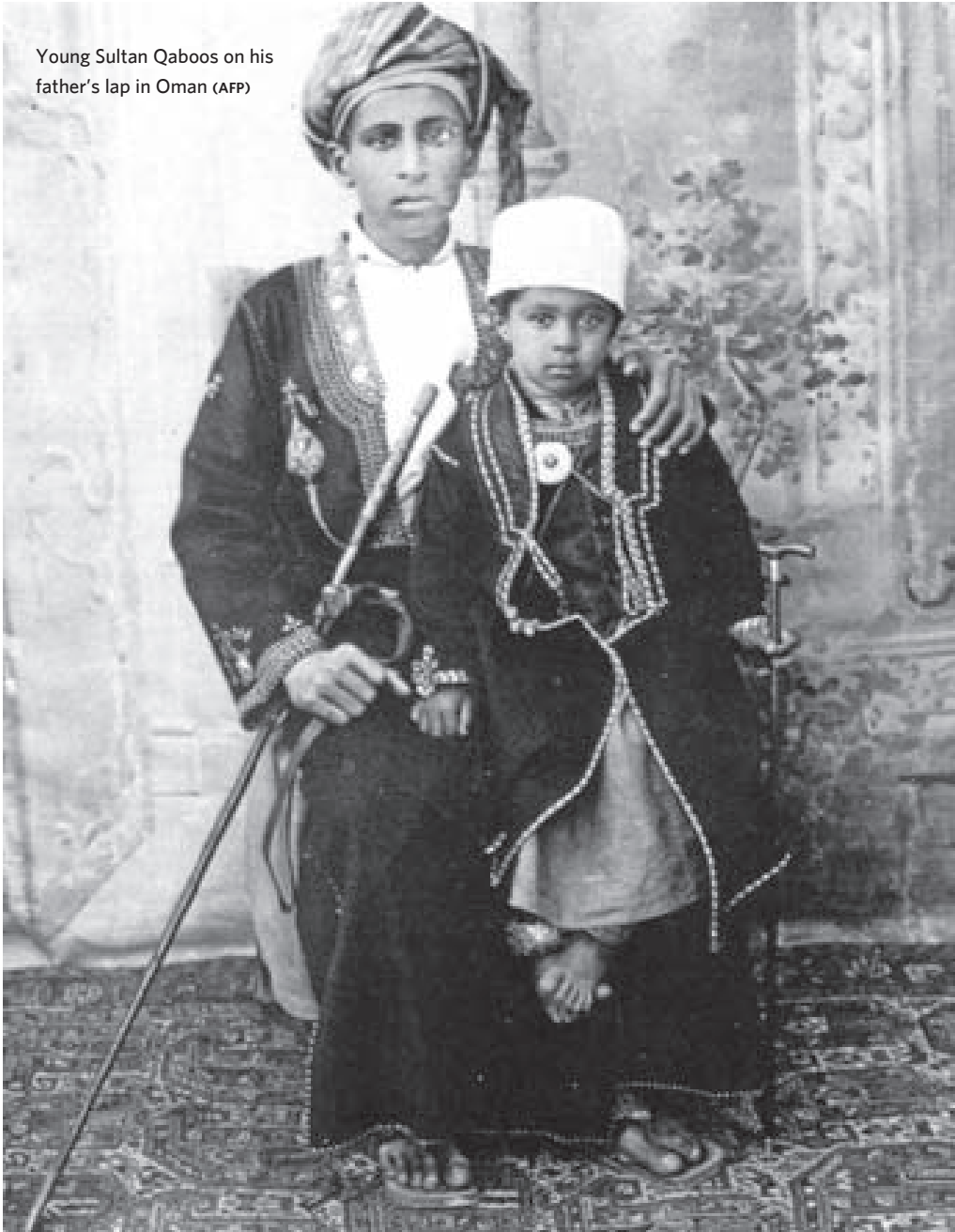
Young Sultan Qaboos on his father's lap in Oman

Unlike other Arab states, Qaboos did not contest Egypt's 1979