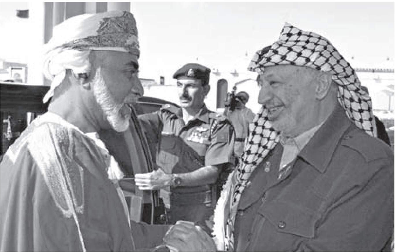
With Palestinian leader Yasser Arafat in Muscat on January 6, 2001

As the longest-serving ruler in the Middle East, the Late Sultan Qaboos earned enormous respect for his ability to bring rivals to negotiating tables