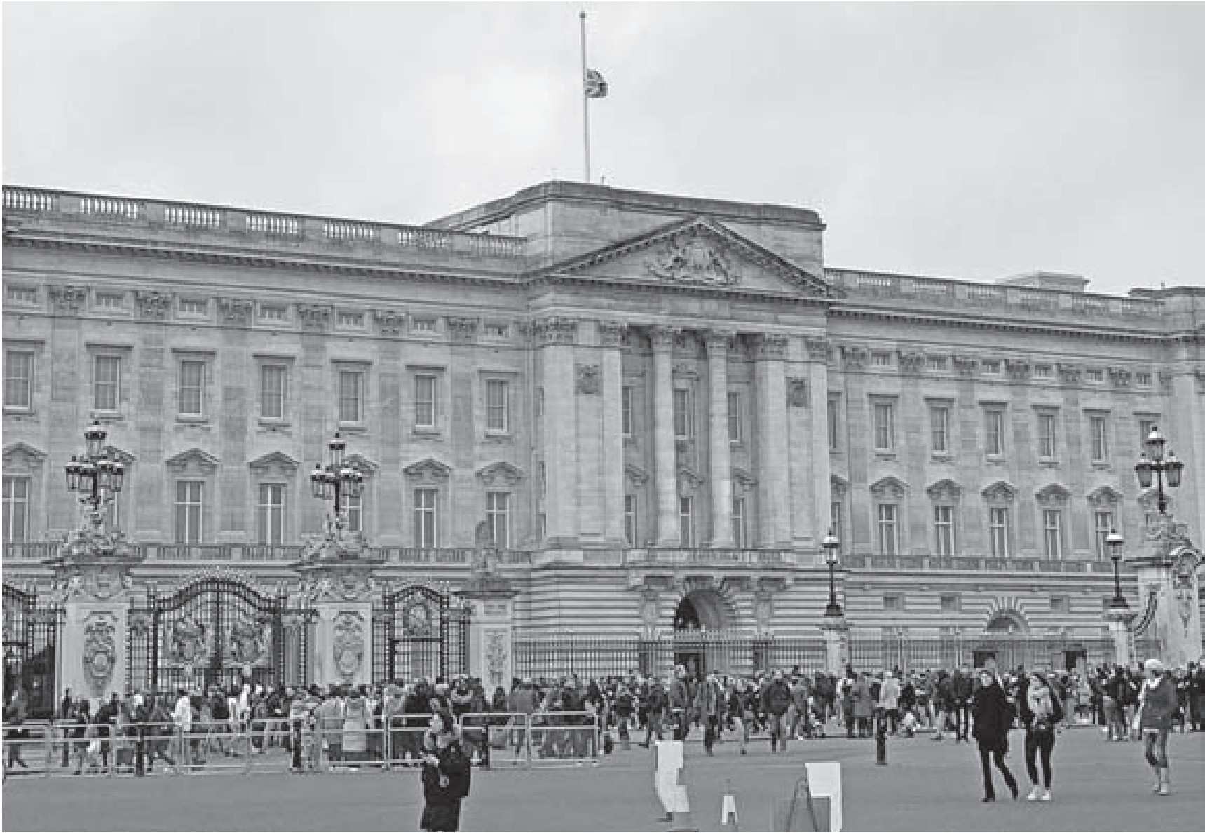
Flags on royal and government buildings were flown at half-mast in United Kingdom to mourn the death of His Majesty Sultan Qaboos bin Said (ONA)

‘His Majesty’s vision steered a foreign policy that placed Oman among the EU’s closest partners’