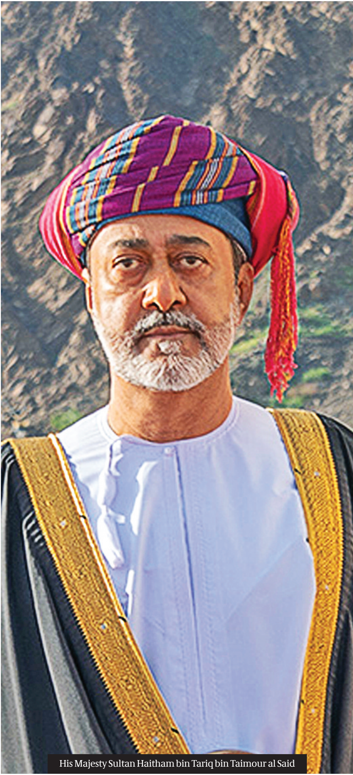
His Majesty Sultan Haitham bin Tariq bin Taimour al Said

Muscat - The Defence Council on Saturday issued a statement reading as follows: ‘The Defence Council would like to bring to the attention of citizens that, in pursuance of the first statement, it called the Royal Family Council to convene to determine who will assume power. ‘The Defence Council received today (Saturday, the 15 th of Jumada al Ula 1441 AH, January 11, 2020) a reply from the Royal Family Council in which it reported that it convened and decided to assign the Defence Council to open the will of His Majesty Sultan Qaboos and instate