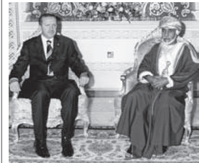
His Majesty Sultan Qaboos bin Said with Turkish Prime Minister Recep Tayyip Erdogan in Muscat on September 27, 2005

His Majesty Sultan Qaboos Bin Said ‘made great efforts for the welfare and development of Oman as well as being