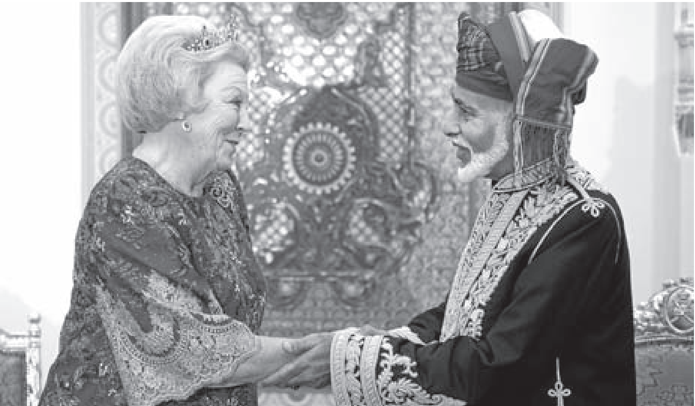
With Queen Beatrix of the Netherlands in Muscat on January 10, 2012